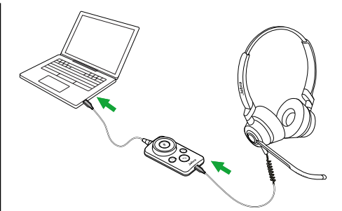
Using the Control Unit accessory:

Just plug the headset into the control unit, then plug the control unit into the PC. USB-A and USB-C versions of the controller are available.