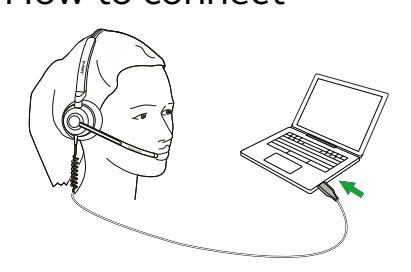
PC/Softphone/Mobile devices with USB-C connectivity: Simply plug into the USB-C port on your PC or any mobile device with a USB-C socket that is compatible with voice calls.